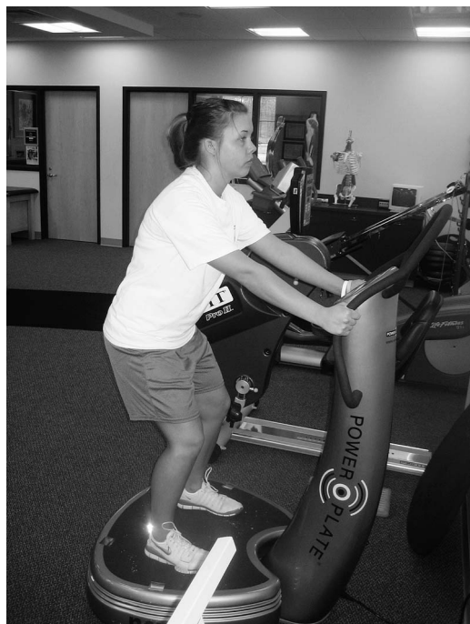
Figure 1. Postural position for whole-body vibration (Next Generation Power Plate, Power Plate North America).

a viable warm-up activity. Because the available WBV platform (Next Generation Power Plate, Power Plate North America, Inc.) allows 8 possible intensity combinations, each was examined. Because previous investigations using the Hoffmann reflex (H-reflex) as an outcome measure have demonstrate variable levels of neuromuscular facilitation over a 30-minute period post-WBV (1), possible changes in CMJH were observed over a prolonged period (30 minutes).