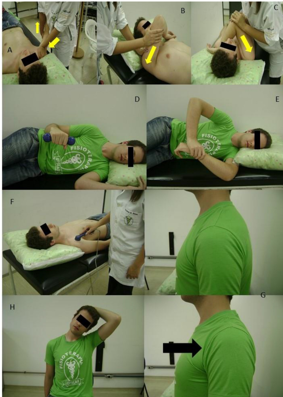
Fig. 2 Protocols for the groups: Experimental group: A, B, and C) Progression of posterior capsule mobilization (arrows indicate the mobilization directions), D) Strengthening of the external rotators, E) Posterior capsule stretching; Comparison group: F) Sham ultrasound, G) Scapular squeezing exercise, H) Stretching of the upper trapezius.

scapular retraction, and upper trapezius (UT) stretching. Participants received five minutes of sham ultrasound to the anterior shoulder in supine (Fig. 2F). Afterwards, they completed three sets of 10 repetitions of isotonic scapular retraction exercises without external resistance by squeezing both scapulae together while sitting (Fig. 2G). The UT stretching was performed three times while sitting. Participants flexed and rotated their cervical spine to the opposite side and same side, respectively, of the ipsilateral UT, 48 and held this position for 30 seconds with 30-second rests between repetitions (Fig. 2H).