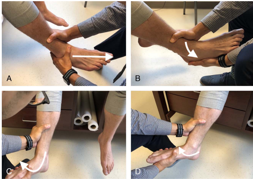
Figure 1: (A) Anterior drawer test, (B) Talar tilt test, (C) and (D) Kleiger external rotation test.